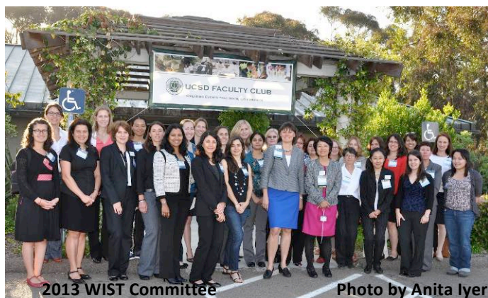
2013 WIST Committee

If you feel inspired to become more active in AWIS-SD, please consider joining a committee. This will increase your activity in our group and even increase the value you get from our activities. For example, if you have to write an article about a meeting, it pushes you to pay attention to it, and aids in coalescing your understanding of a talk through the process of writing. Please visit our website to join a committee of your choosing.