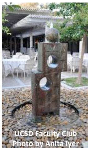
UCSD Faculty Club