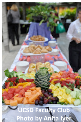
UCSD Faculty Club

The flagship event for AWIS-SD took place on May 18, 2013, at the University of California San Diego (UCSD) Faculty Club. Many speakers provided keen insights into the careers of women in science and technology. The following is a taste of a few of the sessions offered at WIST 2013.